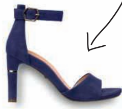
SANDAL, Art. No. 28303. 3 ♥

WRAP SKIRT Sneakers, sandals, high-heels - if a wrap skirt is the right length, it can be matched with any kind of shoe.