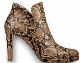
ANKLE BOOT, Art. No. 25036. 2 3