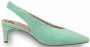
SLINGBACK, Art. No. 29502. ② ③