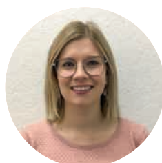
KRISTINA Store BIELEFELD

"This 'ugly sneaker' is straight out of the 90s and is a great combination piece: casually styled with jeans or chic with a maxi dress. An absolute must-have in anyone's shoe collection."