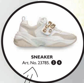
SNEAKER Art. No. 23785. ③ ④