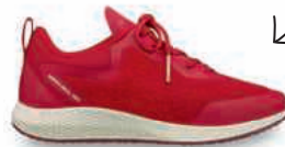
SNEAKER, Art. No. 23734. 4