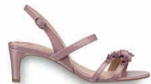
SANDAL, Art. No. 28336. ②