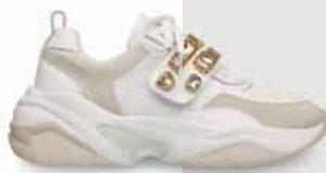
SNEAKER, Art. No. 23785. 3 4

"This 'ugly sneaker' is straight out of the 90s and is a great combination piece: casually styled with jeans or chic with a maxi dress. An absolute must-have in anyone's shoe collection."