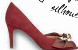
FLAMENCO, Art. No. 29300. ② ③

High heeled shoes are a must so you don't look hunched up! Closed or open high-heeled shoes lengthen the figure and make legs appear longer. If you don't want to walk that tall, go for kitten heels instead, which are better suited for everyday use. If you MUST have flat heels, try loafers.