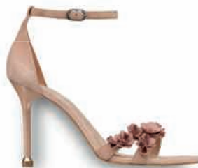
SANDAL, Art. No. 28330. ② ③