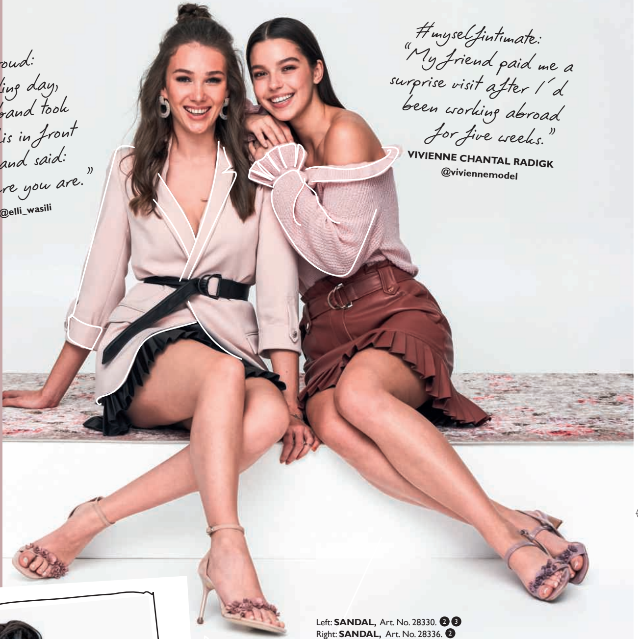
Left: SANDAL, Art. No. 28330. 2 3 Right: SANDAL, Art. No. 28336. 2