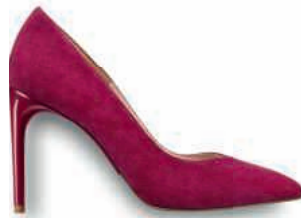
PUMPS, Art. No. 22443. 2 3