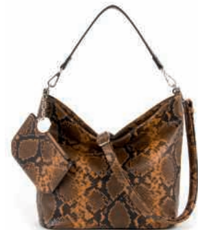
BAG, Art. No. 30181.