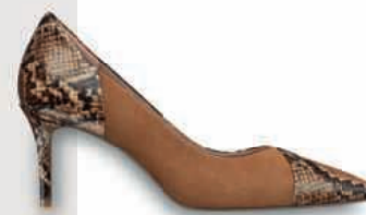
PUMPS, Art. No. 22401. 2

"Pumps with exotic patterns add the finishing touch to any look."