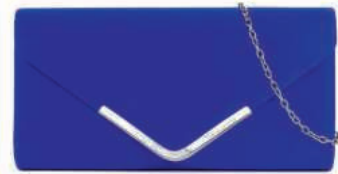
BAG, Art. No. 30454.