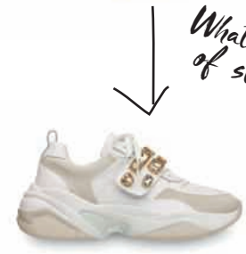
SNEAKER, Art. No. 23785. 3 4