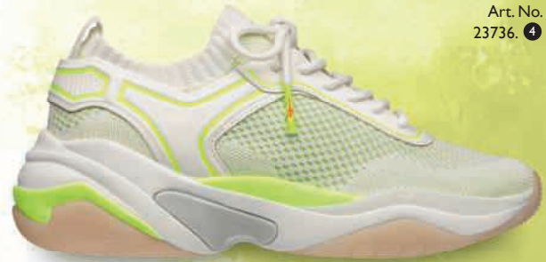
SNEAKER Art. No. 23736. ③ ④