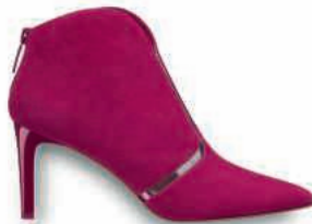
BOOT, Art. No. 25312. 2 3