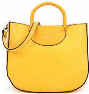
BAG, Art. No. 30380.