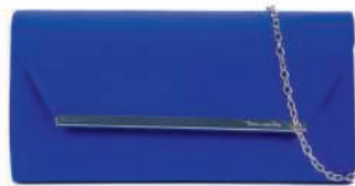
BAG, Art. No. 30452.