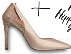
PUMPS, Art. No. 22402. 3 ♥

MAXI SKIRT A maxi skirt evokes feelings of relaxation, freedom and summer!