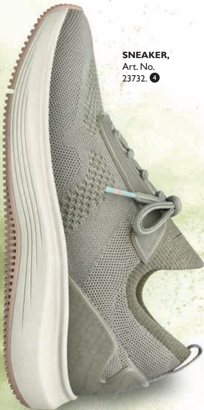
SNEAKER, Art. No. 23732. 4

With real merino wool! For a soft comfortable feel and with maximum breathability!