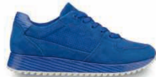
SNEAKER, Art. No. 23731. 2 3