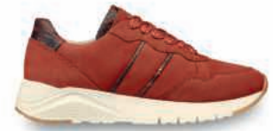
SNEAKER, Art. No. 23704. 2 3