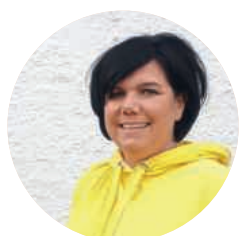
NICOLE Store Minden

No one knows our products better: Tamaris stores sales ladies know just what their customers want, and how to combine the latest styles. This season's new must-haves: