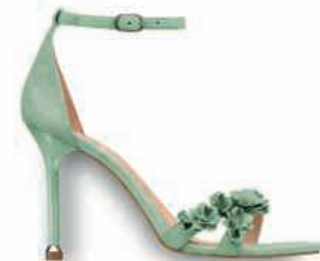
SANDAL, Art. No. 28330. ② ③