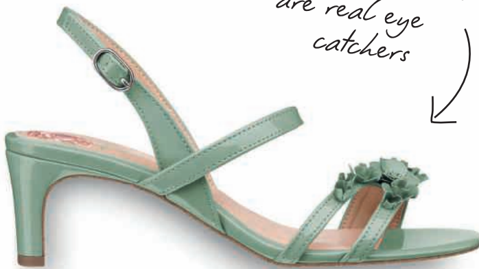
SANDAL, Art. No. 28336. ②

The playful appliqué blossoms are real eye catchers