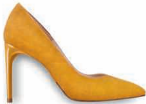
PUMPS, Art. No. 22443. 2 3