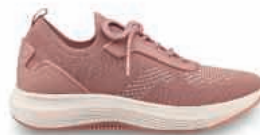
SNEAKER, Art. No. 23732. 4