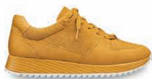
SNEAKER, Art. No. 23731. 2 3

"The awesome sneaker in the latest colour combination is a great fit for comfortable everyday wear!"