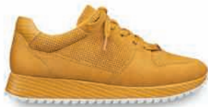
SNEAKER, Art. No. 23731. 2 3